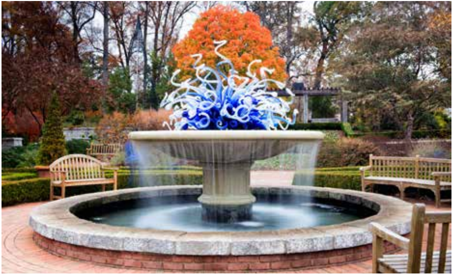
▲ The Atlanta Botanical Garden features an Italian limestone fountain with artist Dale Chiluly's dazzling blue and white glass sculpture dramatically poised above the water. Details: 15-minute cab ride from the Georgia World Conference Center. Admission $21.95. Open 9 a.m.-5 p.m., 6 p.m.-10 p.m.; closed Mondays.