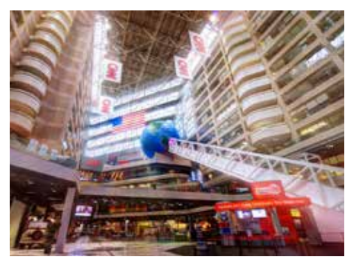
▲Atrium and food court are at the center of CNN's world headquarters. Details: 15-minute walk from the Georgia World Conference Center. Studio tours booked in advance for $15.99. Check for availability.