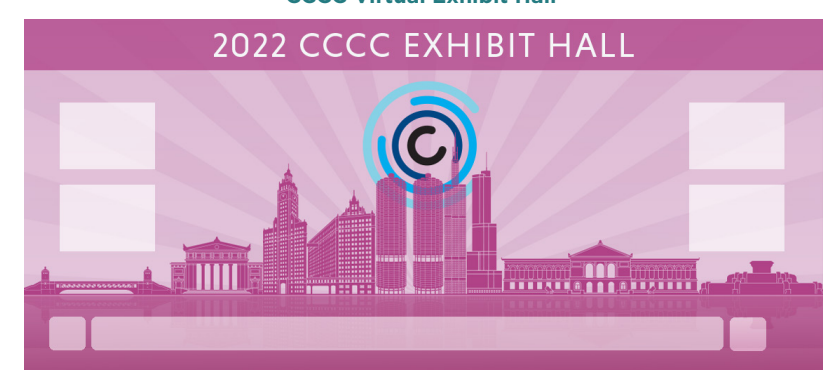
Virtual Exhibit Booth